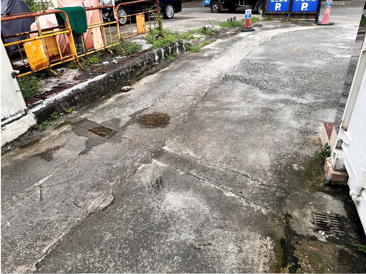
附件 1 - 現場渠道相片